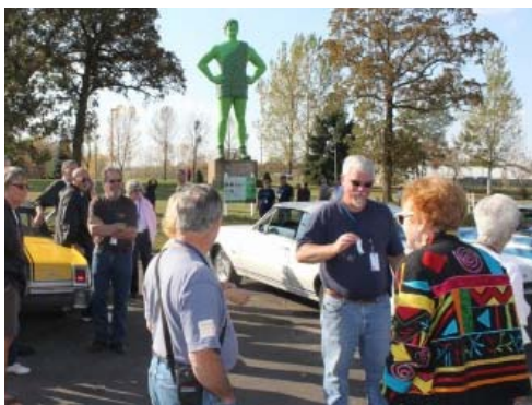
A Blue Earth Yo Ho Ho