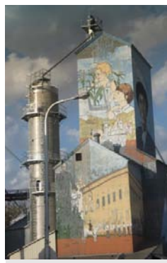
Good Thunder's Great Wall