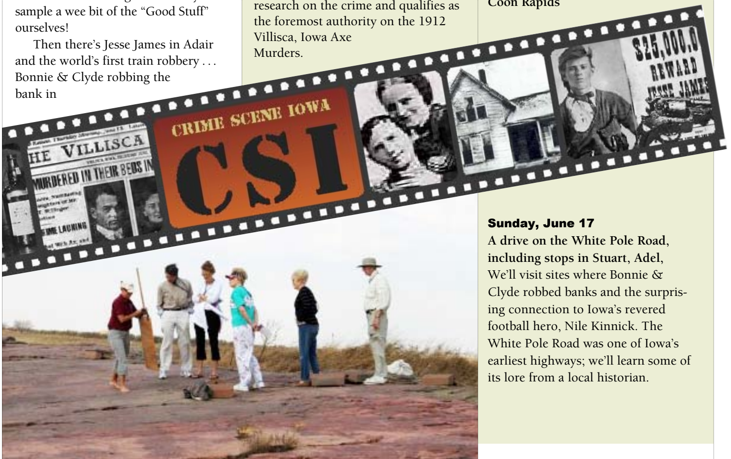
Inspecting the Petroglyph's

A drive on the White Pole Road, including stops in Stuart, Adel, We'll visit sites where Bonnie & Clyde robbed banks and the surprising connection to Iowa's revered football hero, Nile Kinnick. The White Pole Road was one of Iowa's earliest highways; we'll learn some of its lore from a local historian.